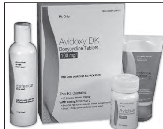
The Avidoxy ™ DK defence kit from Avidas Pharmaceuticals provides a simple and convenient way to help control severe acne.

wash with professional-strength two percent salicylic acid, providing gentle, yet effective cleansing and exfoliation of skin.