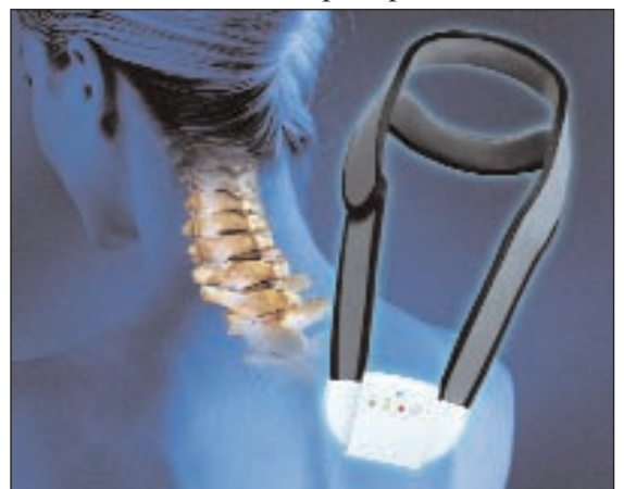
The Cervical-Stim is worn 4 hours per day and can be worn in addition to a brace

Cervical-Stim works by delivering a low-level pulsed electromagnetic field (PEMF) signal that helps activate and augment the body's natural biological healing process after fusion surgery. The Cervical-Stim device contains a microprocessor (computer chip) that generates the treatment signal. The PEMF technology used in the Cervical-Stim is the same as that of Orthofix's other FDA-approved bone growth stimulators. Since 1990, the clinical effectiveness of PEMF bone growth stimulation has been clinically demonstrated in more than 200,000 spine patients.