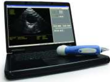
RealTime Abdominal Ultrasound for Bladder and Renal Imaging

For more information about The Prometheus Group, please see us at AUA Booth #1433, call us at 1-800-442-2325, email us at info@theprogrp.com , or click here to visit our website .