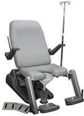
EMMA 1219 Procedure Table/Chair